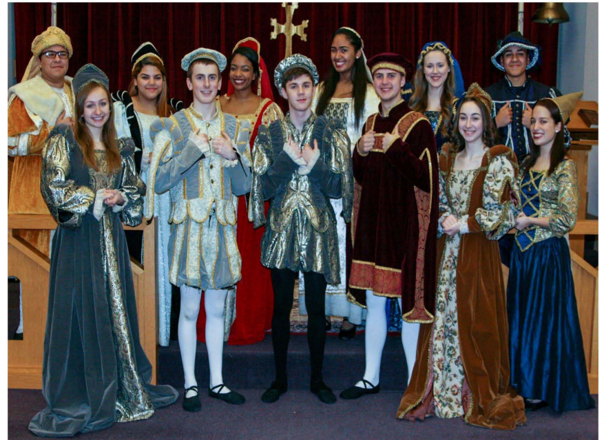
2015 Madrigal Singers

Date: Thursday, December 17, 2015 Place: ACHR Sanctuary 1910 Stanley Street, New Britain, CT Time: 7:00 p.m.